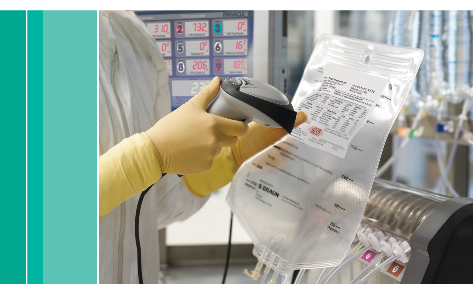
Multi-media training and real-time help tips make the PINNACLE TPN Management System easy to learn and easy to operate