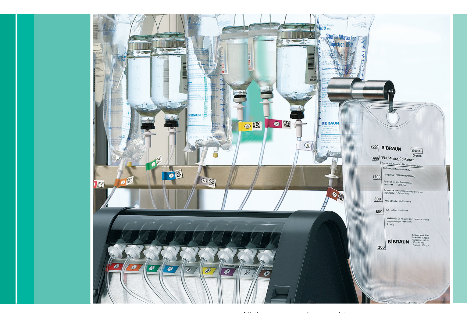
All the names you know and trust