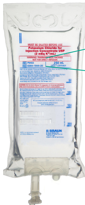
NEW EXCEL CONTAINER