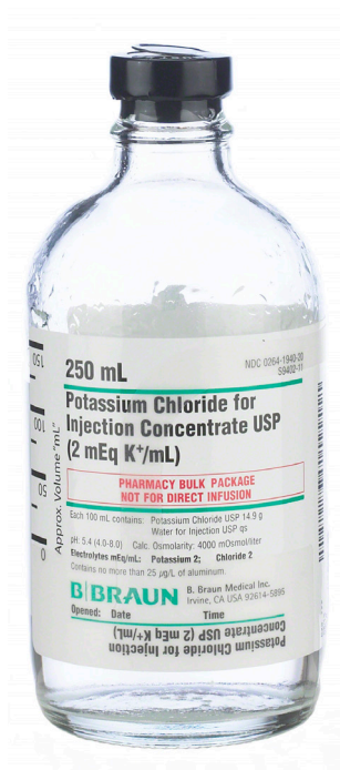
ORIGINAL GLASS BOTTLE

FATAL IF GIVEN BY DIRECT INFUSION – FOR USE IN A PHARMACY ADMIXTURE PROGRAM ONLY