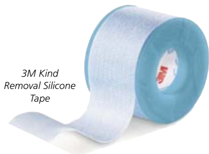
3M Kind Removal Silicone Tape

the BD Nexiva Catheter System is specially designed to cover the size and contours of the built-in stabilization platform, which is unique to the BD Nexiva Catheter System. The dressing features a J-shaped slit that fits snugly around the built-in extension tubing, helping to secure both the tubing and the catheter.