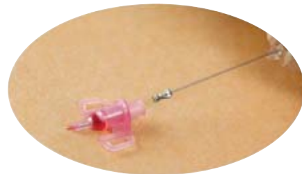
B. Braun Medical Inc.'s Introcan Safety 3 Closed IV Catheter

Another product to help prevent needlesticks and blood exposures is available from B. Braun Medical Inc., Bethlehem, PA. The Introcan Safety 3 is a passive needlestick safety device that provides an added layer of safety and control with a bidirectional blood control valve, which aids in the prevention of blood exposure each time the device is accessed.