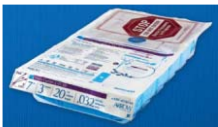
Arrow ErgoPack from Teleflex

Another conference co-sponsor, Teleflex, offers the Arrow ErgoPack, a vascular access insertion system. The ErgoPack System is designed to allow catheters to be inserted more efficiently, which reduces procedure time. Its ergonomic design and compact size make it easy to store, and its components are easily identifiable during a procedure.