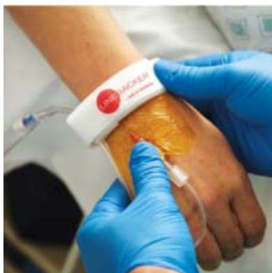
The Linebacker secondary securement device

3M's Tegaderm IV Dressing for the BD Nexiva Catheter System is specifically designed to work with the BD catheter to address catheter movement, dislodgements and fall-outs. Tegaderm IV Dressing for