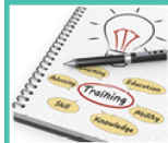
Training Class Schedule