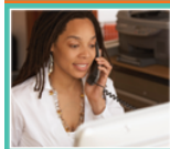
Contact Us / E-mail