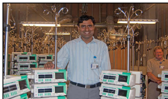
Over 400 Outlook® ES pumps were installed throughout the health system, almost a full year from the start of the project!